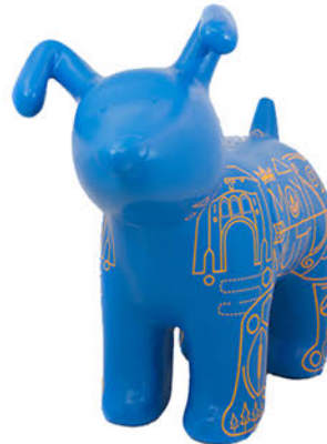
Monmouth Rugby Club MON MUTT