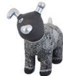
Overmonnow School SKETCH