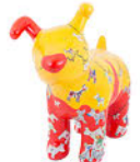
John Kyrle High School ROSS