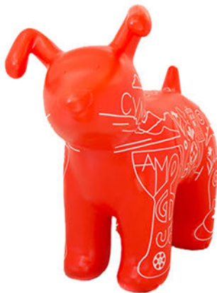
Convey Law CYMRU AM BYTH